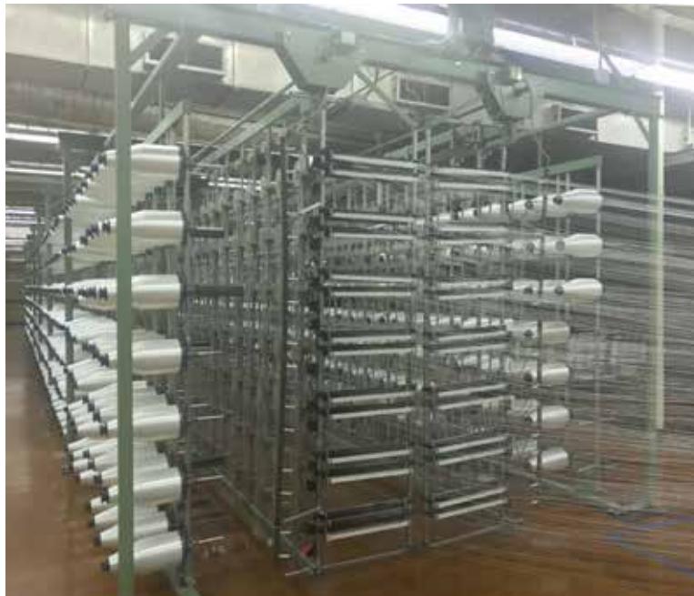
Fiberglass on Model 18 with MagnaTense tensions, static eliminators, and molded adapters