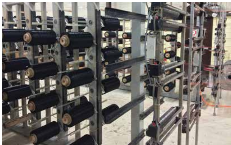
Model 21 with pneumatic tension and optional IR stopmotion system