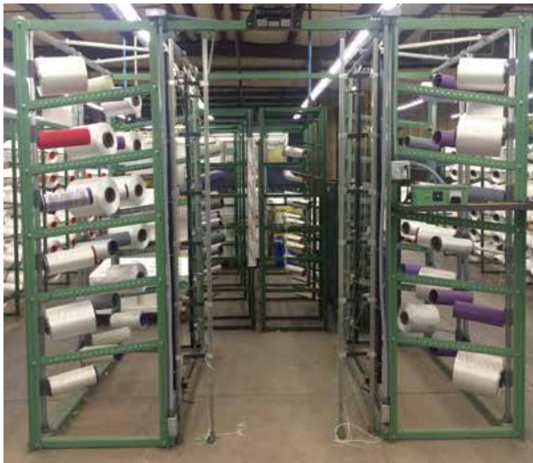
Model 10 with optional balloon supressor wires, and universal package adapters